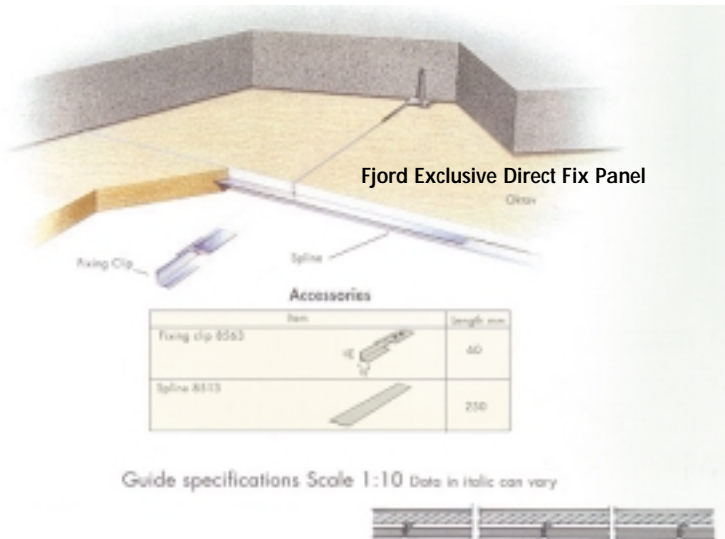
White edge C. size 600mm x 600mm. Installation C3